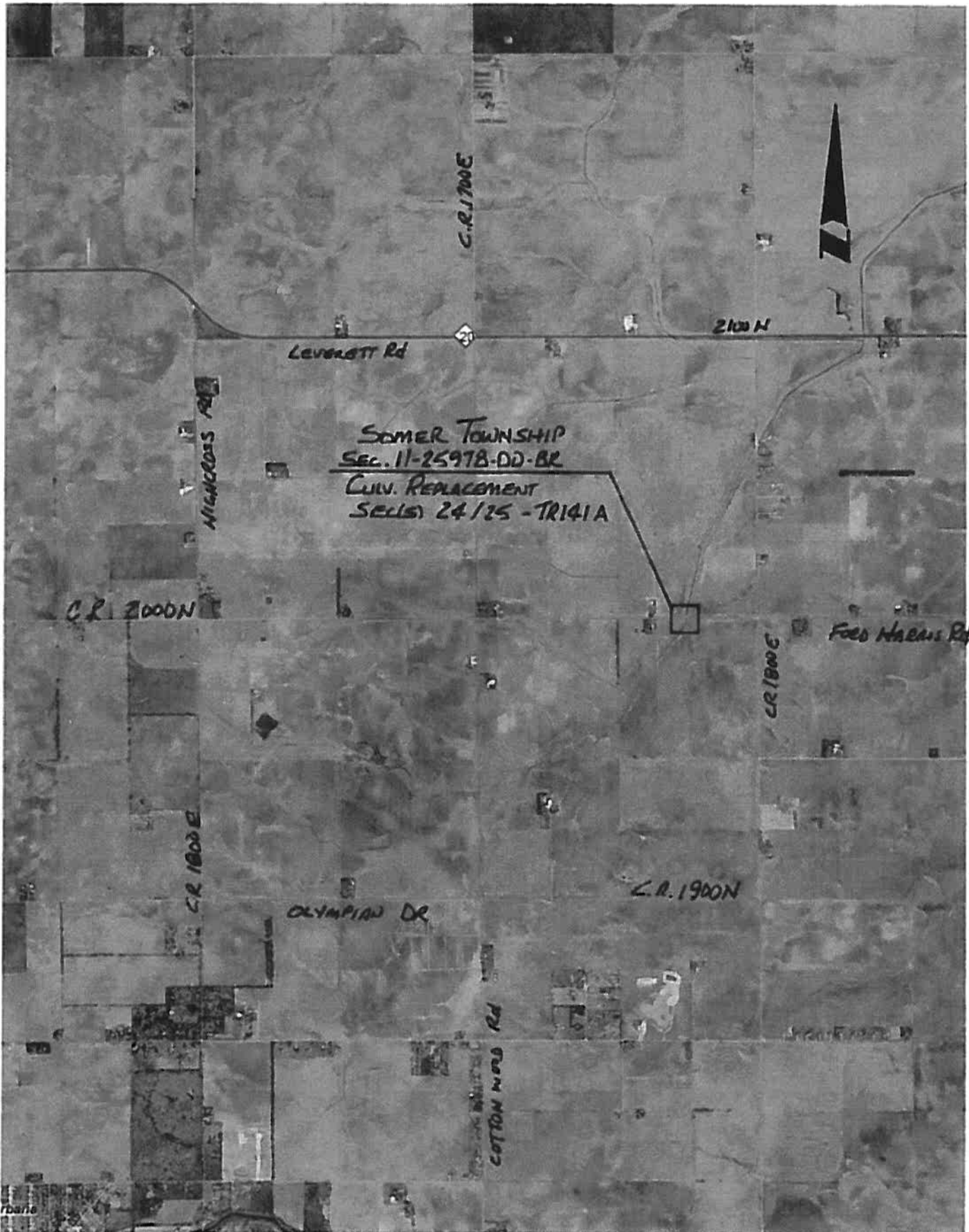
CHAMPAIGN COUNTY - CULVERT REPLACEMENT SEC. 11-2597B-DD-BR SOMER TOWSP T.R. 141A (C.R. 2000N)