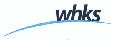
Exhibit B to Professional Services Agreement